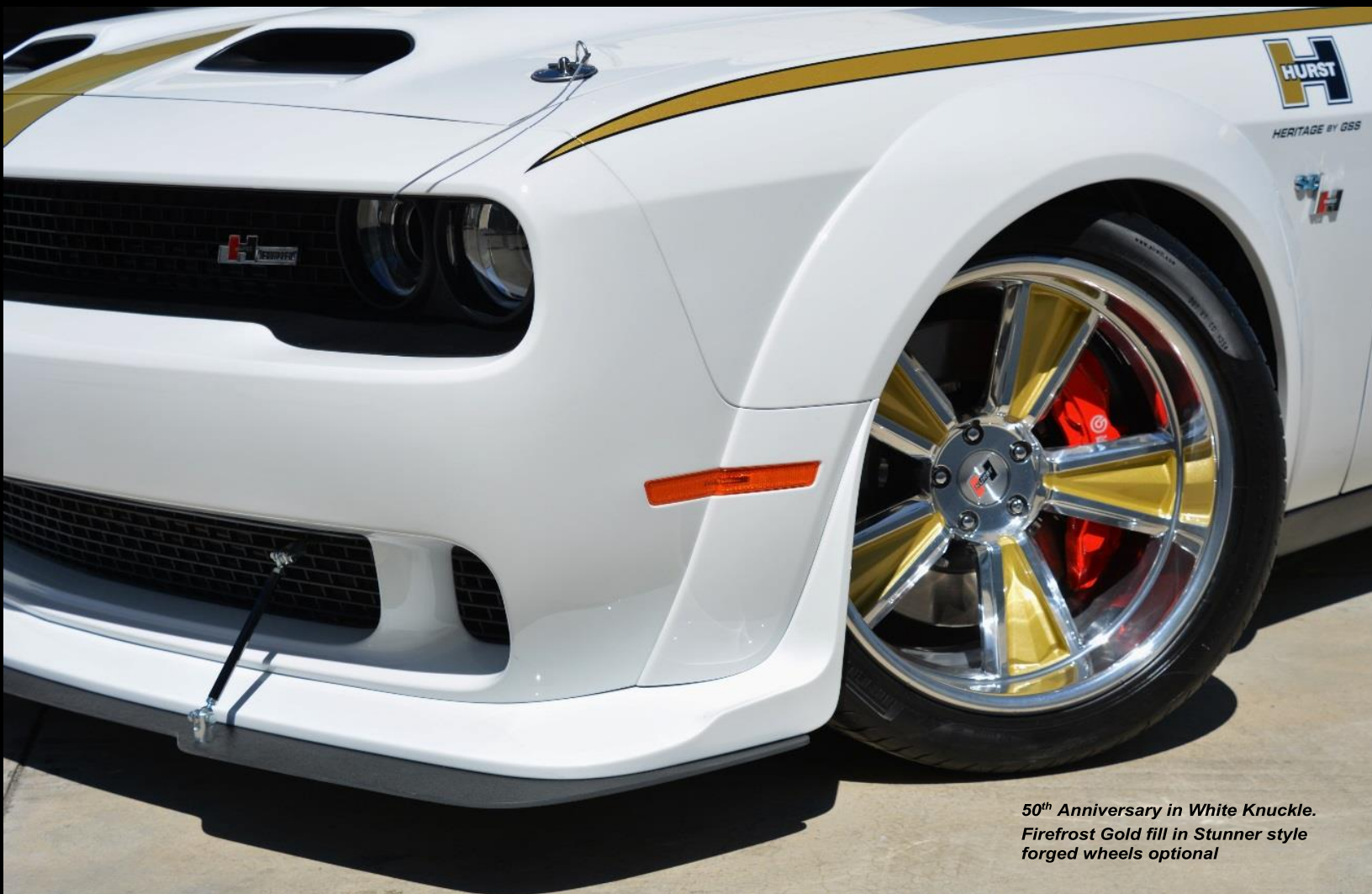
50 th Anniversary in White Knuckle. Firefrost Gold fill in Stunner style forged wheels optional

STUNNER STYLE FORGED MULTI-PIECE WHEELS FOR CHALLENGER WIDE BODY MODELS