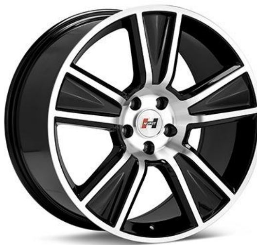
HURST STUNNER MACHINED W/ BLACK ACCENT