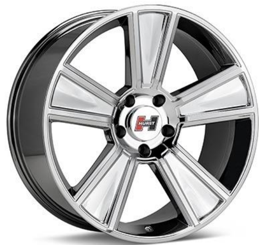
HURST STUNNER IN OPTIONAL SHOW CHROME