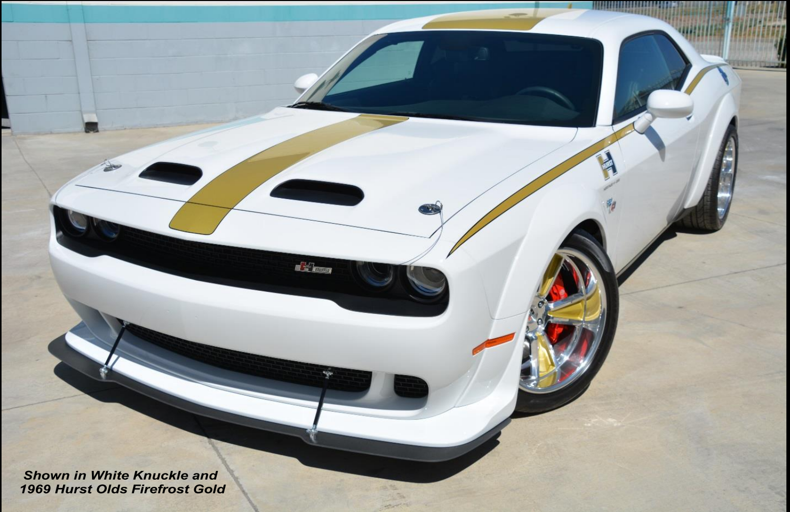
Shown in White Knuckle and 1969 Hurst Olds Firefrost Gold