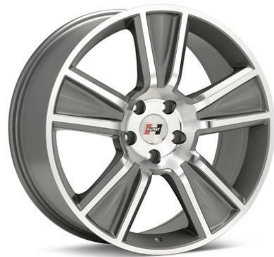
HURST STUNNER MACHINED W/ ANTHRACITE ACCENT